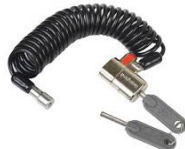
Kensington Tether for FlexiPole CST00148