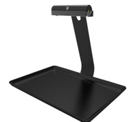
UV-Clean Tray (UV-SA+) 367-5472