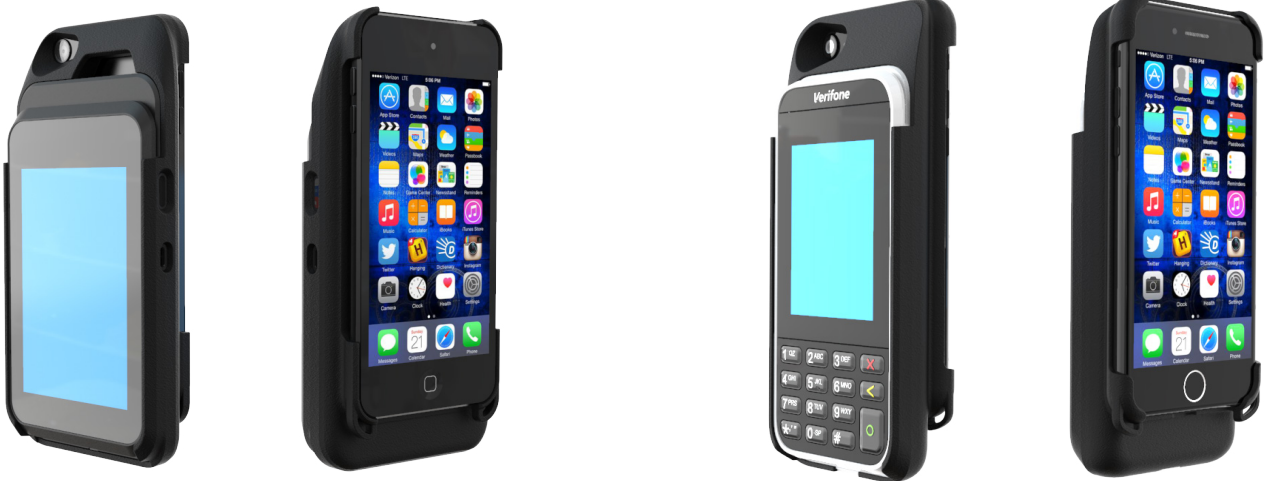
Example: Mobile Protect + Connect Cases