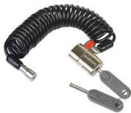
Kensington Tether for FlexiPole CST00148