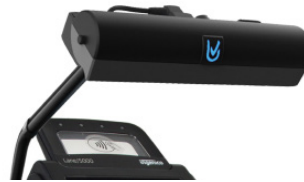
UV Clean Lamp (UV24-PT+) 367-5530