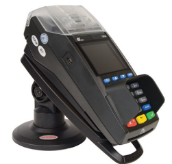
S800 - FlexiPole Compact