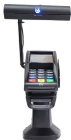
S300 - FlexiPole Plus - UVPT