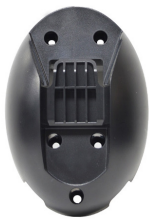
Safe to Pay Wall Mount CST00159