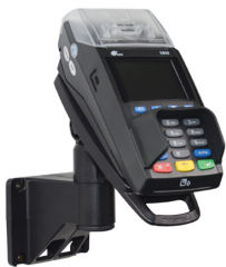
S800 - FlexiPole Wall Mount