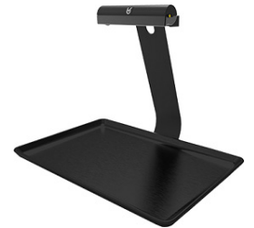
UV Clean Stand Alone (UV24-SA+) 367-5472