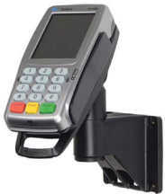
VX 820 - Wall - Locking