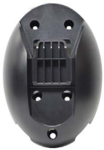
Safe-to-Pay Wall Mount CST00159