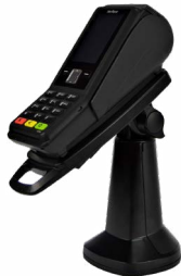
V200c - Plus - Locking