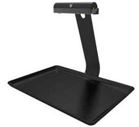
UV-Clean Lamp & Tray (UV24-SA+) 367-5472