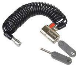
Kensington Tether for FlexiPole CST00148