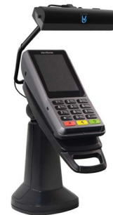
P400 - Plus - UV24-PT+