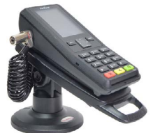
P200 - Compact - Tether