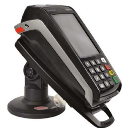
Desk/5000 - Compact - Locking