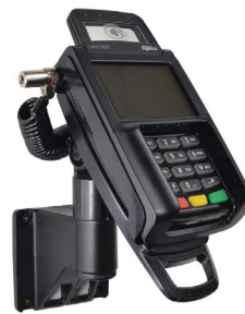
Lane/5000 - Wall - Tether