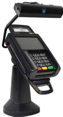
Lane/5000 - Plus - UV-PT