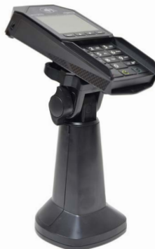
Lane/3000 - Plus - UPM