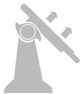
QUICK RELEASE Part No. ASS40121 Weight: 320g