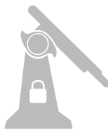
LOCKING Part No. ASS20121 Weight: 355g